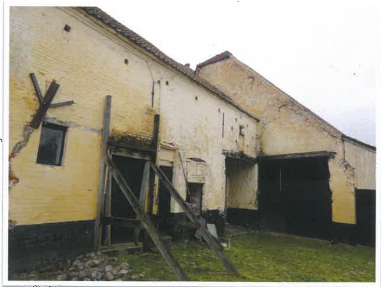
The Barn Buildings in their present state – 2011

A vital element from the British point of view is the erection of a monument close to the North gate in the farmyard to commemorate the British soldiers who fought so gallantly at Waterloo – the only nation without its own memorial on the battlefield. Initial designs of this monument have been drawn up and have been integrated into the overall project for which the necessary authorizations have now been obtained.