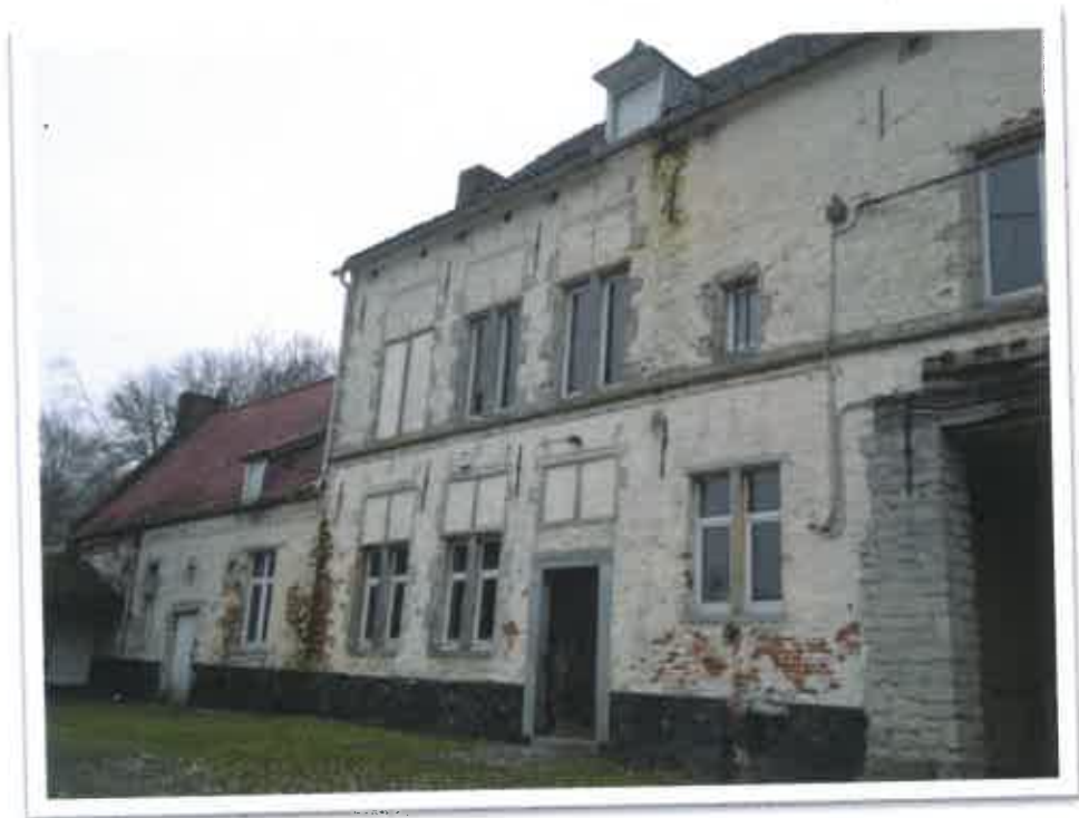
The Farm House in its present state - 2011

The Hougoumont Project constitutes the most important battlefield restoration project within the scope of the Bicentennial Celebrations for the battle of Waterloo, and one with which individuals, corporations and associations can all be associated.