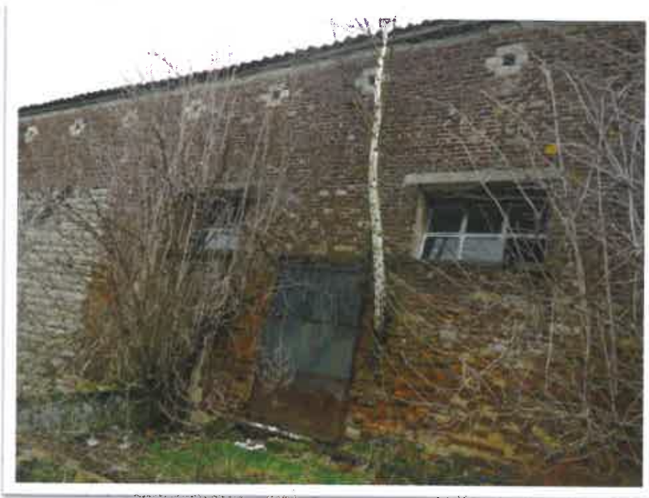
An indication of the degree to which nature is taking over the Hougoumont site

A member of the Project Hougoumont Committee would be very pleased to guide you through the list of specific benefits that your generosity entails.