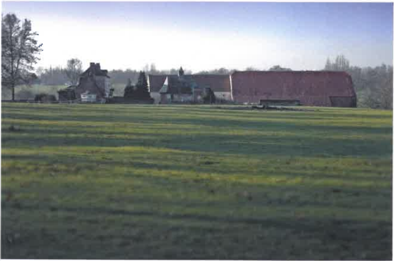
Hougoumont seen from the east of what was once the ornamental garden