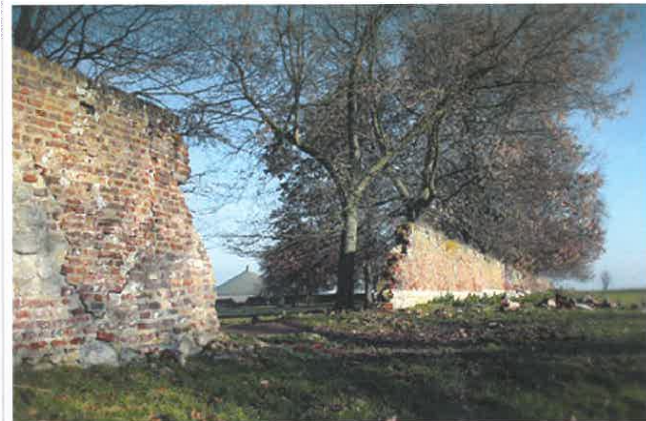
The Lion Mound seen through the hole in the southern wall of what was Hougoumont's Formal Garden