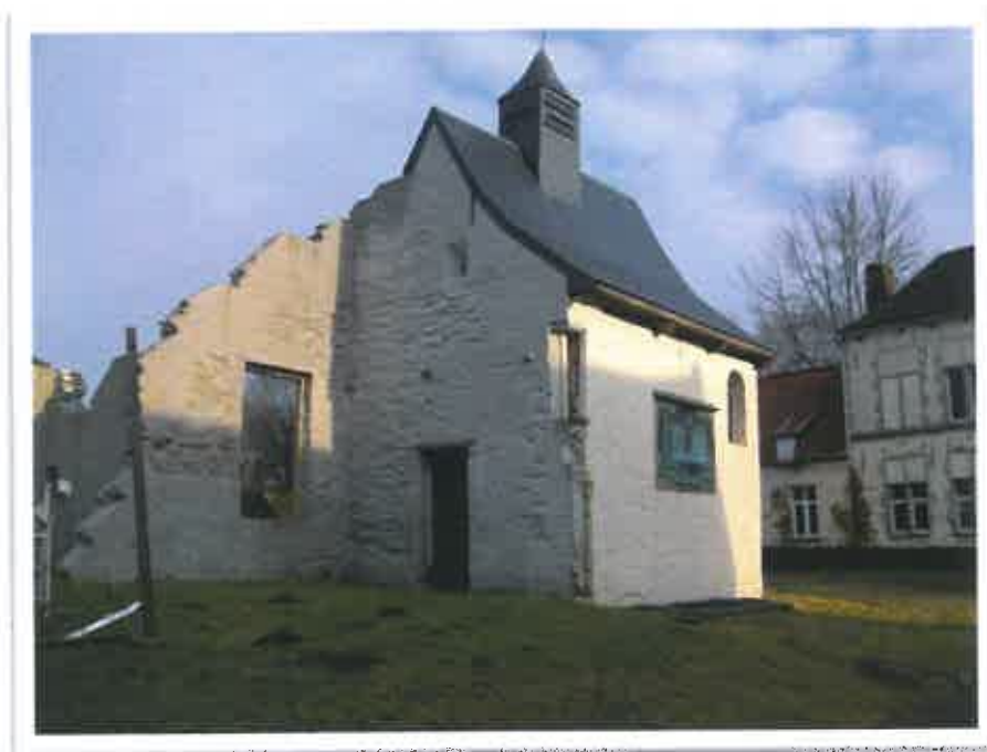
The beautifully renovated Chapel – the only part of Hougoumont to have been restored to date

This represents a unique opportunity for benefactors to associate their names forever with a world famous site.