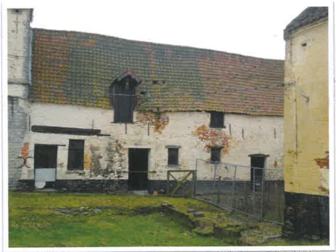
Another perspective of the farm buildings - 2011

The official permit for the restoration works to be carried out was granted in June 2011.