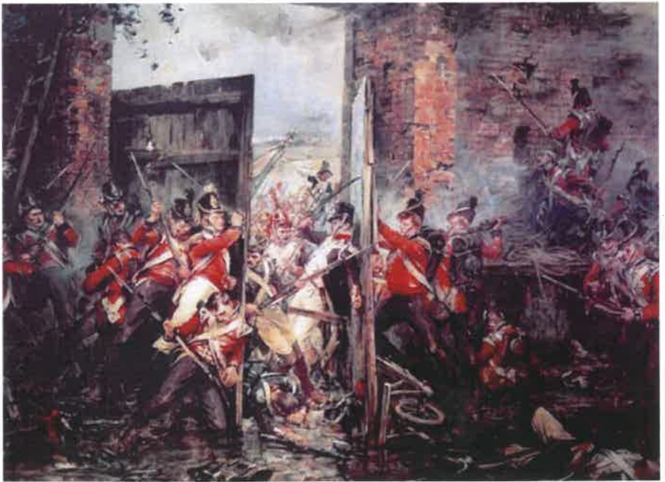
“The Closing of the Gates” - Robert Gibb - 1903

“The success of the battle turned upon the closing of the gates at Hougoumont”.