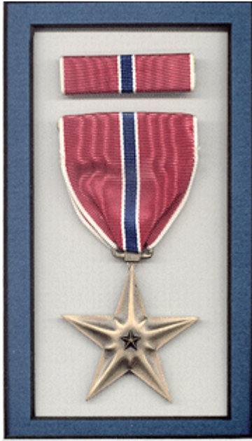
BRONZE STAR Vietnam

“The Die Is Now Cast: The Route Napoleon,” Consortium on Revolutionary Europe Selected Papers , 1995, 521-531. Paper presented in New Orleans 3/1995.