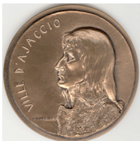
AJACCIO MEDAL Ajaccio, Corsica, France

“The Revolution, Napoleon, and Education,” Consortium on Revolutionary Europe: Selected Papers, 1999 , 436-445. Paper presented in Charleston, South Carolina, February, 1999.