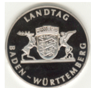
LANDTAG MEDAL Baden-Württemberg, Germany

“The Best Napoleonic Museums of Europe: A Photographic Survey,” Napoleon 2 (March, 1996): 40-45.