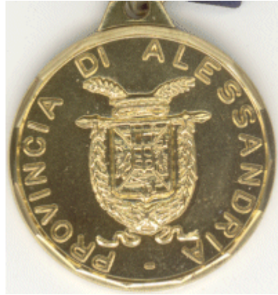
MARENGO MEDAL Alessandria, Italy Obverse side