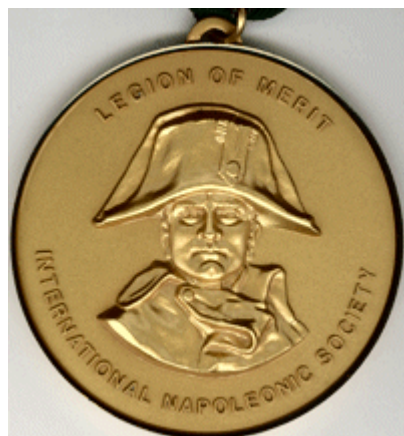
LEGION OF MERIT International Napoleonic Society Obverse side