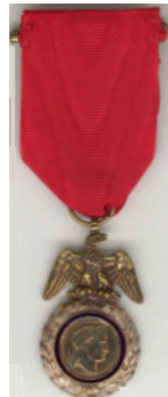
PRESIDENT MEDAL Napoleonic Alliance

“Fundamental Misunderstanding, Disastrous Delays: Napoleon’s Mistakes in 1812.” Consortium on Revolutionary Europe: Selected Papers, 2000 , 292–305. Paper presented in Huntsville, Alabama, March 3, 2000.