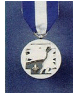
Knight of the Order of Quebec