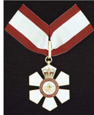
Officer of the Order of Canada